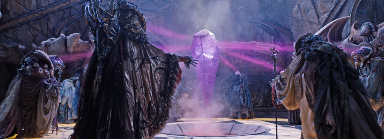
The Dark Crystal: Age of Resistance - © 2019 Netflix

access remote desktops. To ensure a good experience, each artist was assigned an 8 gigabyte (GB) frame buffer. On this setup, each P40 GPU could accommodate three artists (six artists per server).