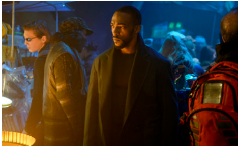
Altered Carbon: Season 2 - © 2020 Netflix