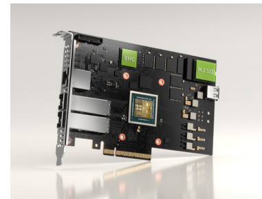
BlueField-3 DPU – 2x 200Gb/s FHHL form factor