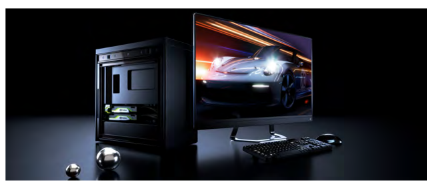
Auto image courtesy of Epic Games and Porsche

Agencies can run containerized applications for machine learning and deep learning in a virtualized environment to isolate workloads and securely support multiple users. By running compute-intensive workflows on the same GPU-accelerated system that runs VDI, agencies can maximize utilization.